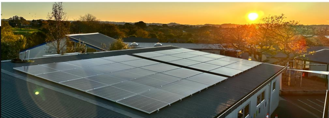
Solar system installed by Ace Electrical on Rotokauri school | Installed Canadian Solar 550W Solar Panels with FIMER PVS 15kW Inverter

$500 donated to Rotokauri School from each system sold