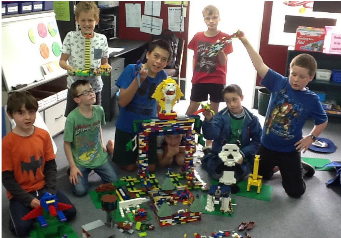
PHOTO FROM THE SENIOR LEGO OPTION

Next year all of our school, with the exception of the new entrant class (Room 1), will be working online with the math programme Math Whizz. This programme was trialed by some members of Room 5 earlier this year with great success. The Board, as in the previous year, will financially support this programme for all students. Parents will be asked to fund $30 through the student's stationery list.